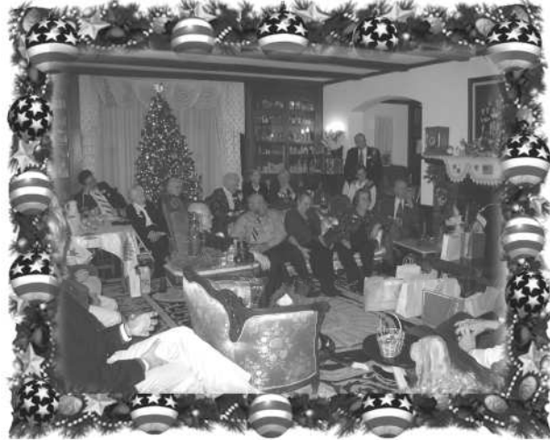
IN ADDITION TO A SIT DOWN NEW YORK STEAK DINNER FOR THIRTY-NINE OUR HOST AND HOSTESS PROVIDED A GIFT EXCHANGE FOR EVERYONE, AS A GAME. IF YOU DIDN'T LIKE THE ONE YOU SELECTED YOU GOT TO PICK ONE THAT WAS ALREADY PICKED.