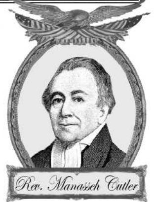
Rev. Manasseh Cutler

I am D r . Sir, sincerely & affectionately Yours Ben a . Tallmadge"