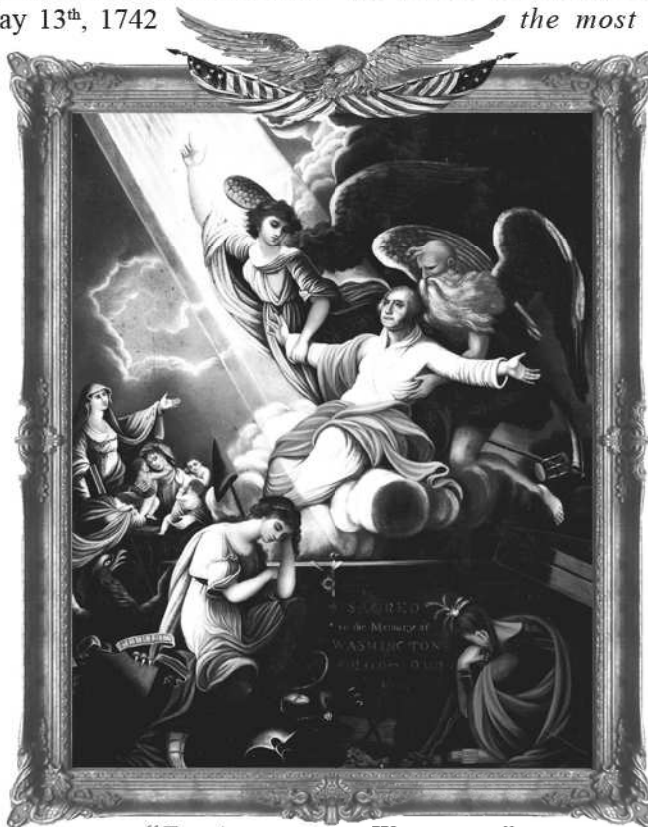
"THE APOTHEOSIS OF WASHINGTON" BY: JOHN BARRALET (1800) THE HISTORICAL SOCIETY OF PENNSYLVANIA.