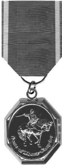
THE SONS OF LIBERTY CHAPTER MEDAL ACTUAL SIZE

At our May 17 th , 2008 meeting the Sons of Liberty Chapter, California Society, SAR approved the striking of the two depicted medals. The first, The Sons of Liberty Chapter's membership medal, authorized for all our regular, life and dual members is shown on the left.