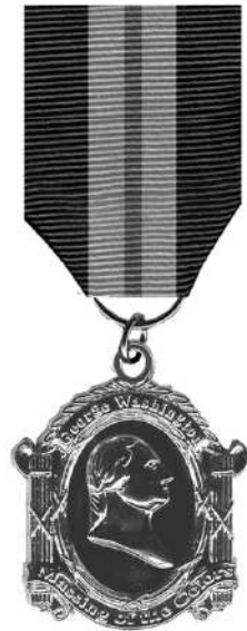
THE MASSING OF THE COLORS MEDAL ACTUAL SIZE

If there is a demand, we will have miniature versions of both medals struck.