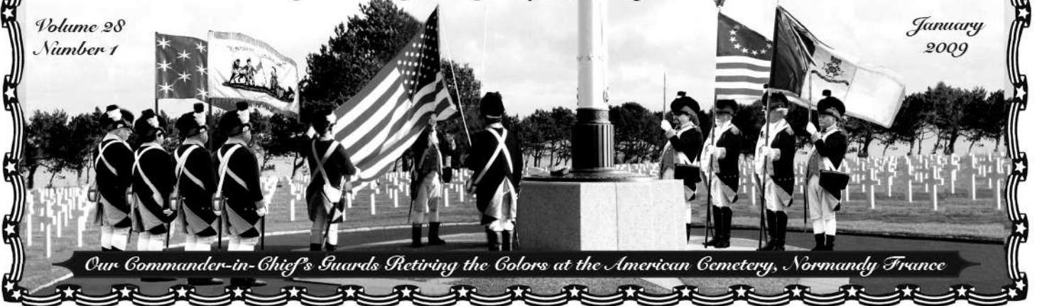
Our Commander-in-Chief's Guards Retiring the Colors at the American Cemetery, Normandy France